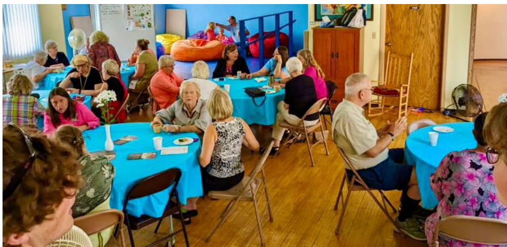
Some of the people who gathered for fellowship after church service