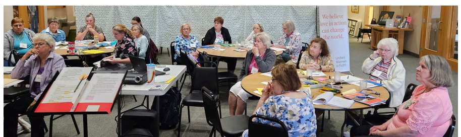
See pages 5-6